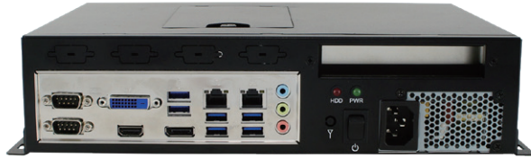
Rear I/O (Based on MI992VF-7820 & MI991 & MI990 I/O)