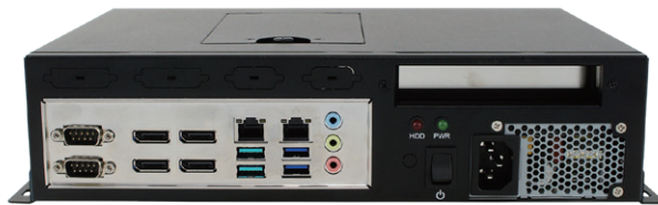
Rear I/O (Based on MI989 I/O)