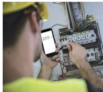
Electric Power Inspection