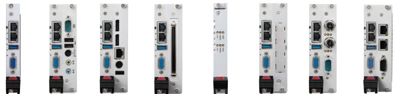
cPCI-3630 cPCI-3630D cPCI-3630G cPCI-3630M cPCI-3630N cPCI-3630S cPCI-3630T cPCI-3630TR